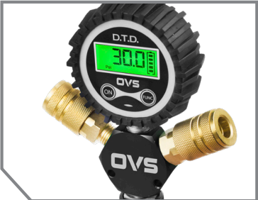
DIGITAL TIRE GAUGE MANIFOLD INCLUDED