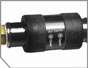
HIGH FLOW AIR SLIDER VALVE