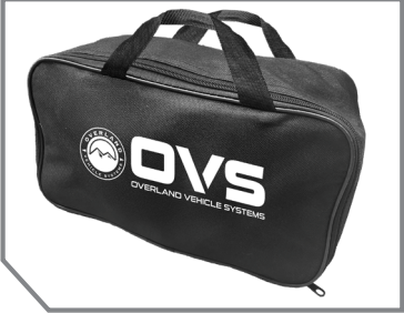
BALLISTIC NYLON STORAGE BAG INCLUDED